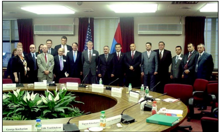
A high level Armenian Government delegation visits Washington D.C. in September 2005

assistance to Azerbaijan, except for disarmament-related assistance (pending “demonstrable steps to cease all blockades and other offensive uses of force against Armenia and Nagorno-Karabakh”).