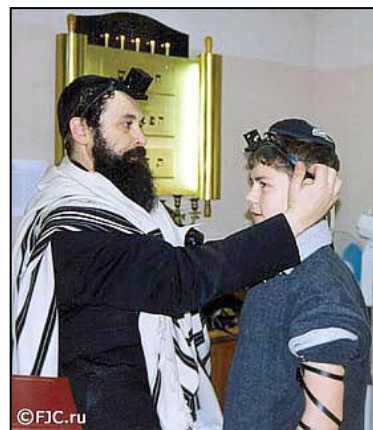
Jewish life in Yerevan