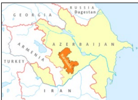
Location of Nagorno-Karabakh

The dominant issue for independent Armenia has been its protracted dispute with Azerbaijan over Nagorno-Karabakh. Christian Armenians and Turkic Azeris have fought to control this border territory since the 19 th century, when each group claimed the land as theirs (many Armenians call the territory by its alternative Armenian name, "Artsakh"). After their conquest of the region, the Soviets made Nagorno-Karabakh an autonomous region within Azerbaijan, leaving a majority Armenian enclave in Azeri territory, angering both groups.