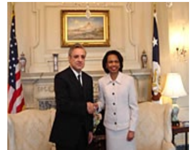
Armenia’s Foreign Minister Vartan Oskanian visited Washington, D.C. in March 2007, for meetings with Secretary of State Condoleezza Rice

While its close neighbors, Azerbaijan and Georgia, voiced their support for the 2003 U.S. effort to overthrow Saddam Hussein in Iraq, Armenia remained in favor of Russia’s anti-war policy. But in January 2005, despite national opposition, the government sent 46 military personnel to Iraq, although in December 2004, Prime Minister Andranik Markarian called Armenia’s presence in Iraq purely symbolic and for political purposes.