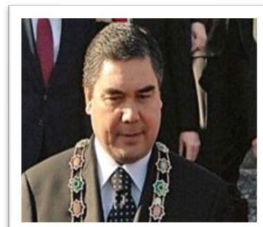
President Berdymukhammedov at his February 2007 inauguration ceremony

In his inaugural remarks, the new president called for continuing the course set by Niyazov, proclaiming a gradualist approach to change and rejecting the import of “foreign models of democracy,” dampening hopes of a radical break with the past. He reassured Russia, Turkmenistan’s most important economic partner, that existing contracts to supply natural gas would be honored, easing fears of a disruption in energy supplies to Russia and Europe. Although exiled oppositionists were quick to dismiss Berdymukhammedov as a tool of the Niyazov old guard, Western leaders appeared willing to encourage the new president’s public mention of reform.