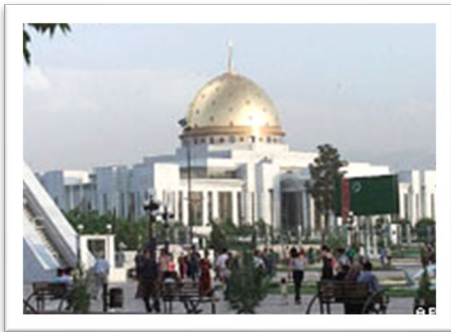
The gold-domed Presidential Palace in the capital, Ashgabat, built by Niyazov

Parliamentary elections held in 1999, 2003, and 2004 were considered neither free nor fair, with all candidates selected by the government and no opposition party or candidates allowed. Starting in 1994, only Niyazov's Democratic Party of Turkmenistan (DPT), the former Turkmen Communist Party, was permitted to field candidates, and all opposition groups were officially banned. Niyazov's rule was characterized by a zero-tolerance policy towards all real or suspected opposition activity, and purges of government officials who showed independent or critical views.