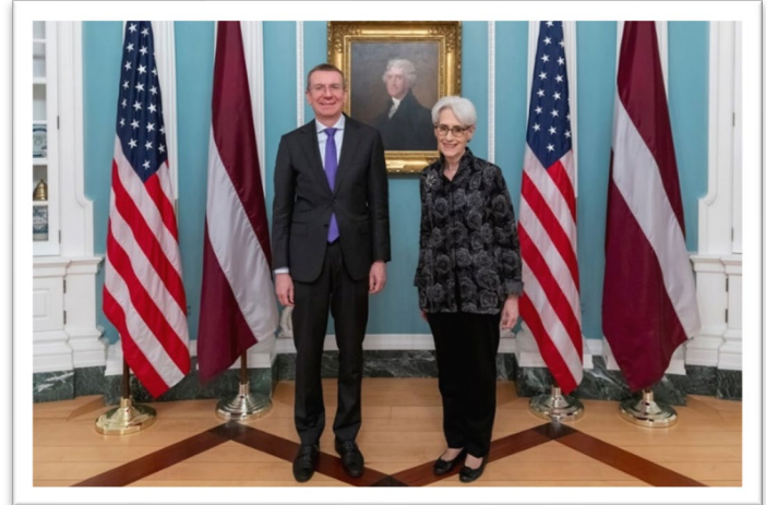
Deputy Secretary Sherman with Latvian Foreign Minister Edgars Rinkevics

On June 14, 2021, President Biden met with President Levits and other Baltic leaders in Brussels. The conversation focused on strengthening political, military, and economic cooperation. President Levits urged President Biden to be tougher when interacting with Vladimir Putin.